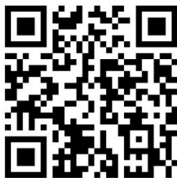
VHT Map Link